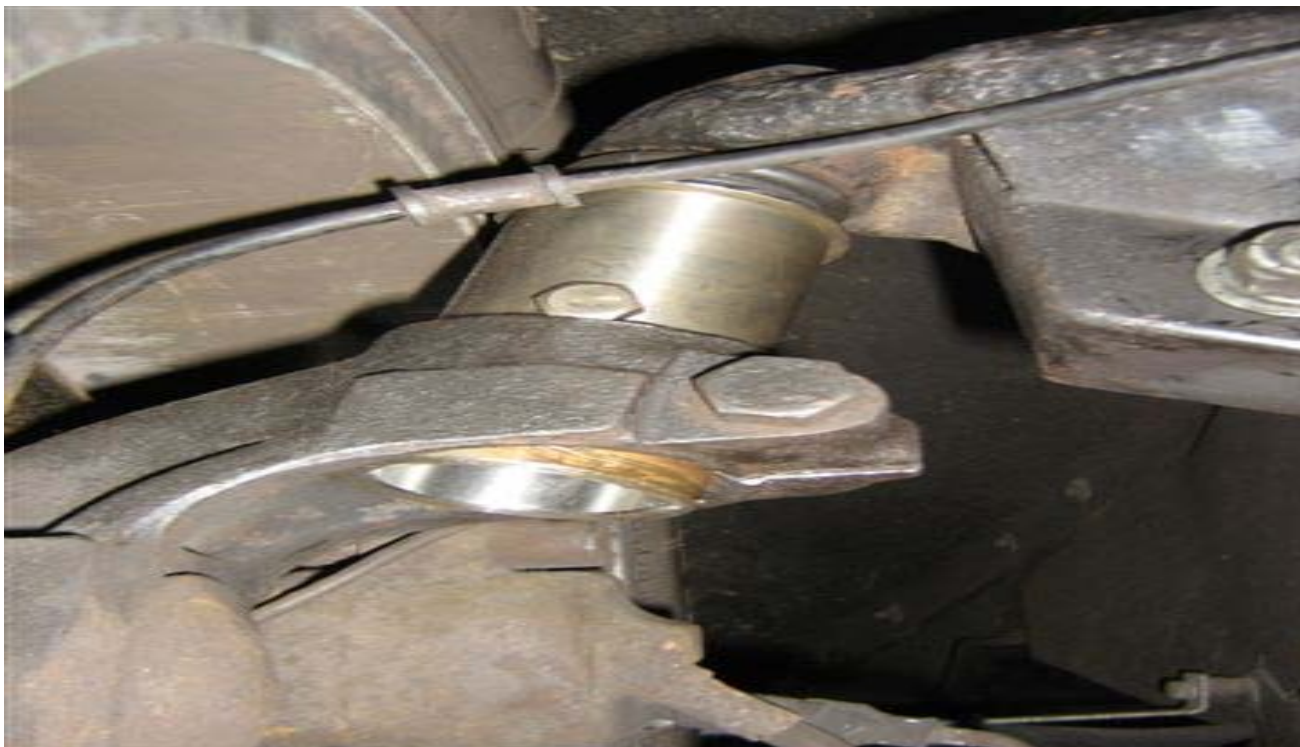
PHOTO 2 New collar fitted

After fitting the new collars (see photo 2) the ride height at the front of the car was now the same as the rear. This set up changed the camber angle by +3 degrees. To overcome this, the Lower Arm inboard fixing on the front crossmember had to be moved 10.5mm outboard. As the new holes eyed the old ones 3mm washers were welded round the new hole locations. (see photo 3) The crossmember was removed by supporting the power steering rack from above prior to releasing it and removing the Lower Arm inboard joint.