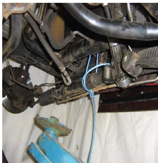
PHOTO 3 Showing welded washers

The car's ride height is now the same as the rear and the suspension is softer. The handling does not feel stiff anymore and I believe is more in line with the standard Granada rear suspension making the ride even more comfortable.