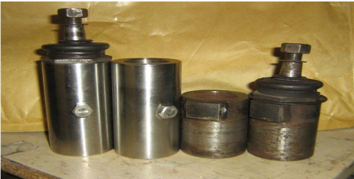
PHOTO 1 New and old collars

A new set of link collars was made 37mm longer (see photo 1) and fitted to the wishbones.